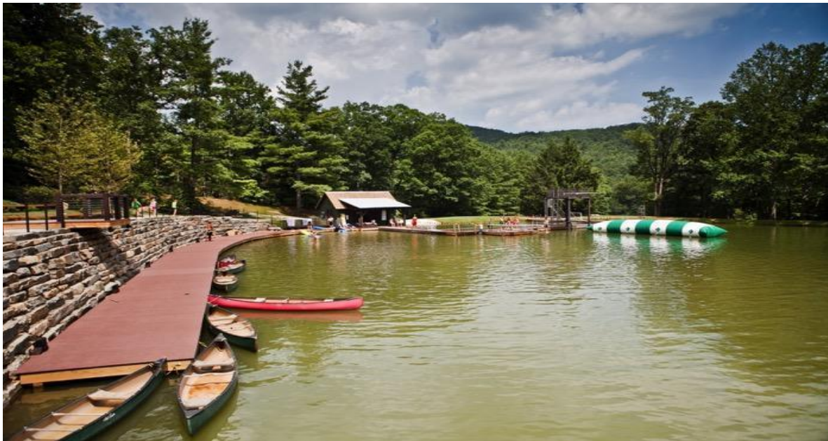
A perfect day on Lake Doris